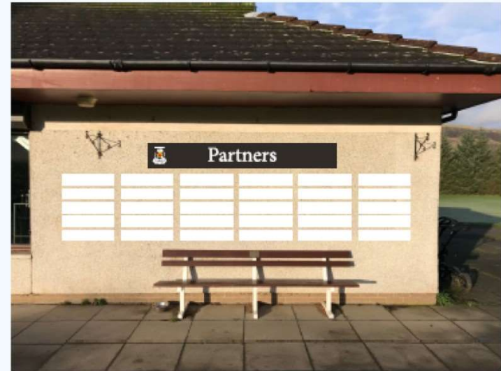
Pro Shop Partners' Wall