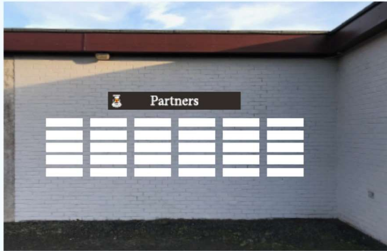
Clubhouse Partners' Wall